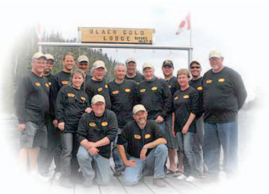
Boddington Tournament - Class of 2010

BRITISH COLUMBIA SALMON FISHING – Your Tournament Host, Black Gold Lodge, will donate four – standard package trips for ONE person each. Prizes to be for our Friday – Monday trips for the 2012 season (space available). We have operated our Lodge in Rivers Inlet for 23 years and have been growing steadily. This can only happen by offering quality service and equipment. Rivers Inlet is world renowned for it's huge Chinook Salmon, in fact the world record Chinook was caught off the mouth of the inlet. During work on the hatchery programs in the fall of each year, Chinook of 100 lbs. plus are regularly found in the river systems. This along with over-sized Coho Salmon entering the Inlet each summer puts Rivers Inlet in a class all it's own. All other pacific salmon and the usual assortment of bottom fish – Halibut, Ling cod etc. are available as well. Situated on the rugged central coast of B.C. it is a haven for all the marine mammals. Jim Rough along with his wife Brenda and son Michael will be your hosts for these donated fishing trips.